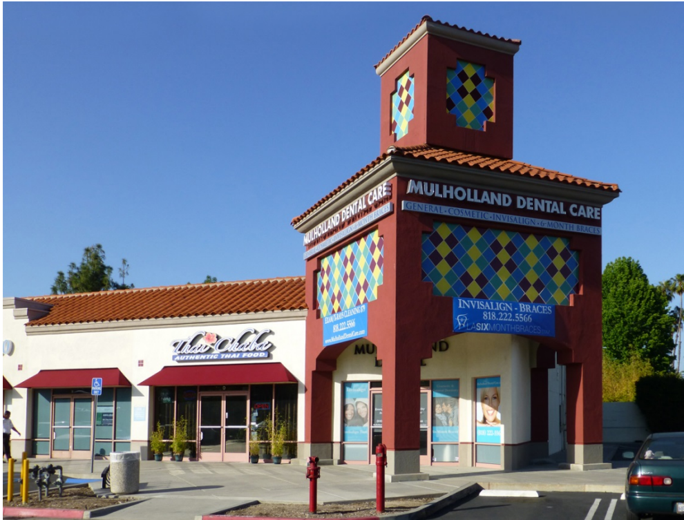
Figure 1: Existing wireless site antennas camouflaged within cupola.