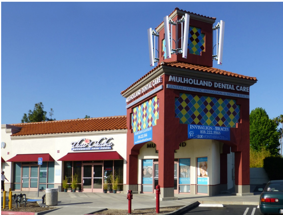
Figure 2: Existing wireless site antennas camouflaged in cupola with non-discretionary